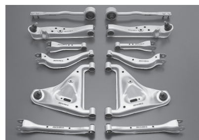
Suspension Link (for S14)