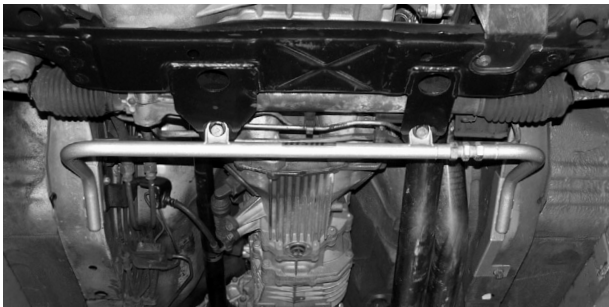
Installation, BNR32 front