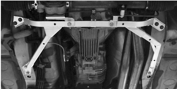
Installation, BNR34 front

Material: Aircraft-grade duralumin (for S15, BNR32 trunk) High-carbon steel (for BNR32 front, BCNR33, BNR34)