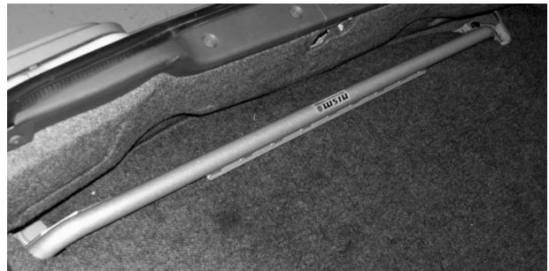
Installation, BNR32 trunk