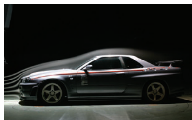
Wind tunnel testing