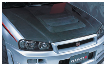
① R-tune carbon hood