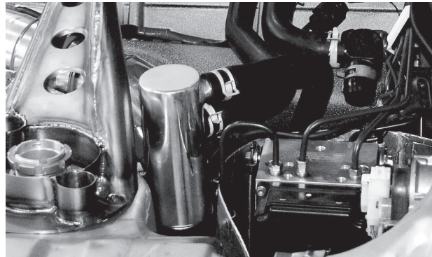
Example of installation on BNR34