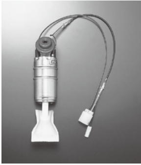
Fuel Pump (for BNR32,260RS)