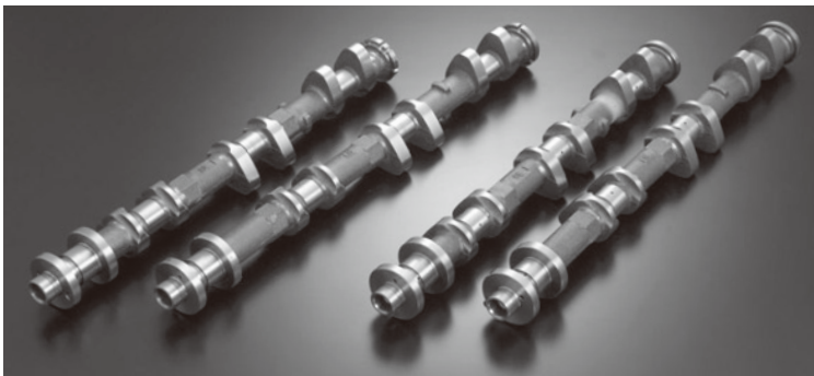
High-Lift Camshaft Set (Spec-1)